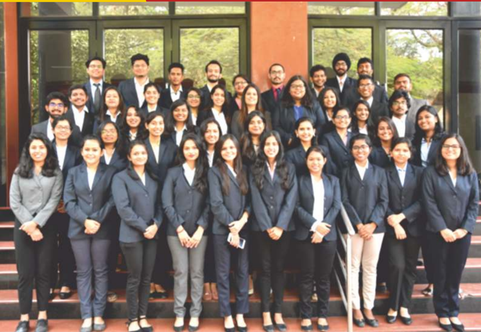
MSc. Batch of 2017-19